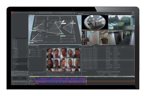
FortiCentral Video Management Software