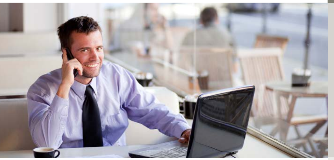
FortiClient Advanced Endpoint Protection