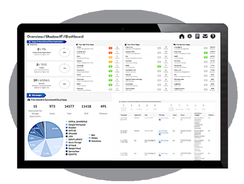
FortiCASB Shadow IT Dashboard

FortiCASB has seamless integrations with FortiGate and FortiAnalyzer to provide a comprehensive view of the risk posture and usage for all sanctioned and unsanctioned (Shadow IT) cloud applications used in an organization, enabling administrators with insights to enforce policy-based access controls for risky applications.