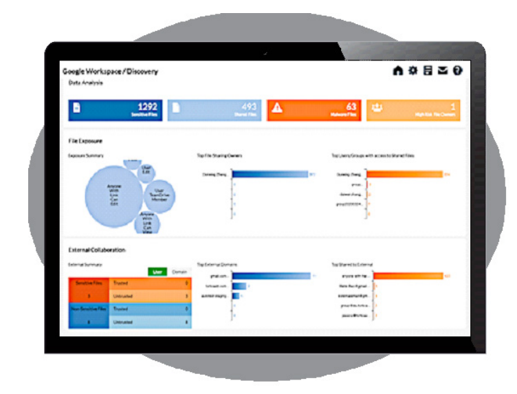
FortiCASB Usage and File Insight Overview

FortiCASB offers many tools to provide insights into user behaviors and their activities on cloud-based applications. Administrators can monitor usage as needed and have the ability to view user entitlements, dormant users, and conduct detailed configuration assessments.